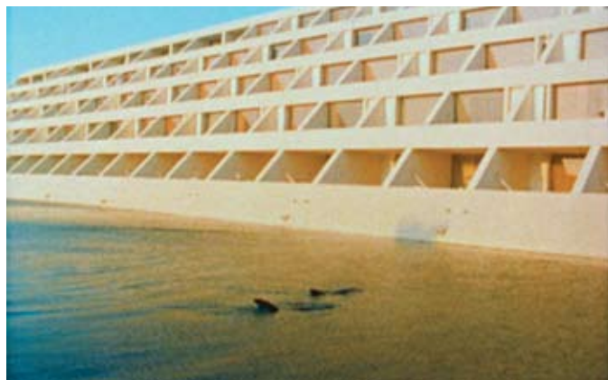
Above: Cyprien Gaillard, Cities of Gold and Mirrors, 2009